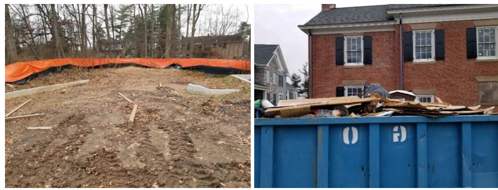
Pictured above are photos of the inadequately sized mark out and curbing for the trash and recycling containers onsite and construction waste container containing mandated materials mixed with trash.

Following these efforts, it should be noted that the MCMUA received several emails from the Township officials thanking us for our time, dedication, and training efforts as a part of this collaboration.