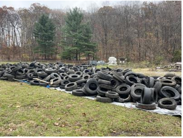
Pictured above are the tires collected from the cleanup awaiting loading and transportation to the recycler at Lake Hopatcong State Park in Ledgewood.